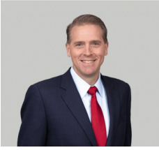
Midterm Elections: What Will Happen In November?

Scott Jennings is Senior Political Contributor for CNN and is one of the nation's most well-known conservative commentators. He appears daily on the network's various shows, including the 10pm debating show "Newsnight with Abby Phillip," where clips of his 4-on-1 exchanges go viral on a weekly basis.