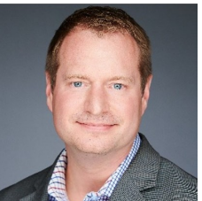
Perfecting Your Prospecting Playbook: Developing Your Entry Point to Meaningful Conversations