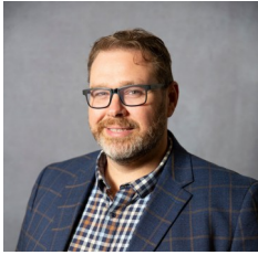
IT Threats in a Cyber World