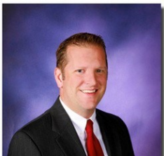
Industry Legal Discussion